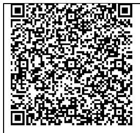
Figure 3: Print2Screen compatible QR code

As a step towards improved security, only resources from trusted websites are compatible with Print2Screen (e.g., col.org, cemca.org.in, oasis.col.org, youtube.com, vimeo.com, nptel.ac.in, commons.wikimedia.org, and www.flickr.com).