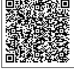
Figure 1: An example of a QR code

Uluyol and Agca (2012) introduced a text-plus-mobile model where 2D barcodes are encoded with web URLs, which host related animations, embedded in textbooks. Their results revealed that the participants in the text-plus-mobile phone condition had higher retention and transfer scores than the participants in other conditions. They also found significant differences between the text-plus-mobile phone condition and the text-only and text-plus-picture conditions on retention and transfer scores. Agca and Özdemir (2013) used Microsoft Tag technology in conjunction with printed books to facilitate learning of English language as a foreign language. Their findings show that the environment created curiosity for students and made the vocabulary learning activity more attractive by motivating students in a positive way. A similar study was conducted by Liu, Tan and Chu (2010), who used QR codes and augmented reality in teaching English. QR codes have also been used in library systems where collections are coded into QR codes and made available as printed pamphlets or online on the library webpage (Ashford, 2010). Another application is to use QR codes in conjunction with GPS technology to deliver location-aware content to learners (Chin & Chen, 2013). Further, QR codes have been used in classroom noticeboards to provide students with additional information via the Internet (Chaisatien & Akahori, 2007).